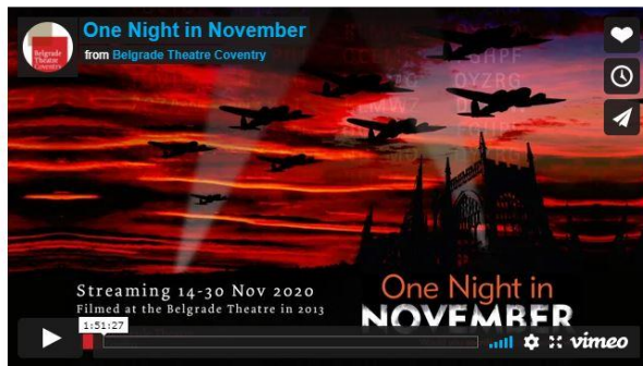
One Night in November from Belgrade Theatre Coventry on Vimeo .

Welcome to One Night in November Screening. Enjoy the show!