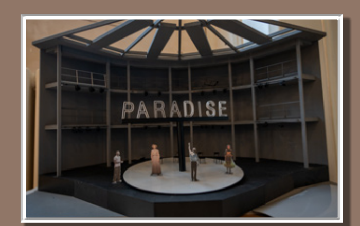
Model of The Glass Menagerie se