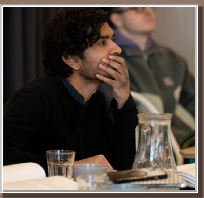
Atri durina rehearsals